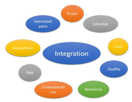
Figure 1: Integration Management-Processes and people.

Figure 1 presents the integration of project management that includes coordination of all processes and interfaces of the areas included in your cycle. As a result, organizations tend to reach their goals with greater safety, agility and quality in interlocking steps [4].