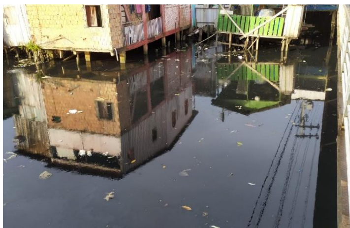
Figure 1: Water quality of the Cachoeira Grande stream in the São Jorge neighborhood in Manaus with the naked eye.

Figure 1 below shows the reality of water quality in most streams in the Amazonian capital in the middle of urbanization.