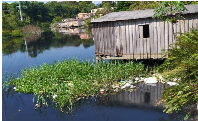
Figure 2: Urban Solid Waste (MSW) disposed in the Cachoeira Grande stream in the São Jorge neighborhood of Manaus.

Figure 2 below demonstrates the lack of awareness of both the population and public agencies regarding the neglect of Urban Solid Waste (MSW) in the streams of Manaus.