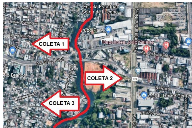
Figure 5: Collection points for water quality analysis of the Cachoeira Grande stream.

Figure 5 below points out the collection points for the analysis of the water quality of the Cachoeira Grande stream.