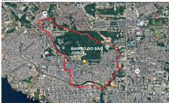
Figure 3: Geographic localization of the territory of São Jorge neighborhood in Manaus. Source: Adapted from [18].

coordinates of latitude are 3° 106' 458" South and of longitude are 60° 029' 169" West. According to the census of the Brazilian Institute of Geography and Statistics (IBGE), its population is 21,643 inhabitants [17]. The figure 3 below shows the territory of the neighborhood highlighted in red with about 292 hectares of territory.