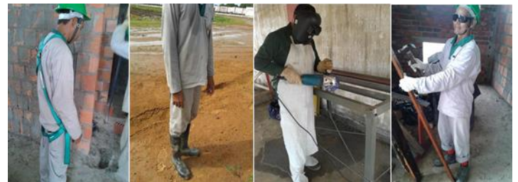
Figure 2: Use of PPE.

It is worrying to know that 70% do not use personal protective equipment because they do not have this habit and safety education, either by forgetfulness or because it bothers figure 2.