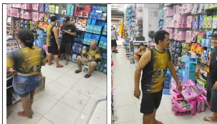
Figure 3: Workers without protective equipment.

Each corridor has 1 meter free, on busy days, customers and employees have difficulty in transit and makes it difficult to attend.