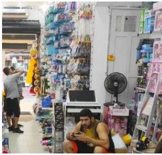
Figure 4: Intervals and rests. Source: Authors, (2019).

Workers have an hour break and rest in periods with little movement in the establishment, during which time they are sitting on benches.