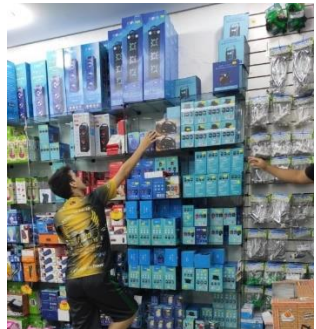
Figure 5 - Lack of security to pick up products

Workers have an hour break and rest in periods with little movement in the establishment, during which time they are sitting on benches.